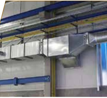
Duct of the PUSH-PULL-system