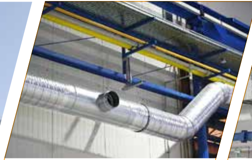
Duct of the PUSH-PULL-system